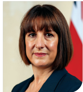
Official portrait of Rachel Reeves MP

Other significant tax increases included higher capital gains tax rates and a future reduction in inheritance tax business and agricultural reliefs. Despite the additional revenue, the Office for Budget Responsibility (OBR) projects that increased spending will mean that borrowing will still be over £70 billion in 2029/30. Not without reason does the OBR say, “...this Budget delivers a large, sustained increase in spending, taxation, and borrowing”.